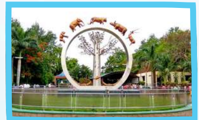
Nehru Zoological Park