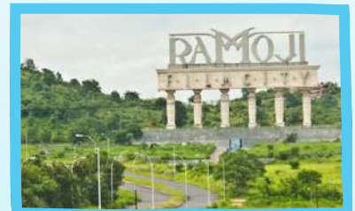
Ramoji Film City